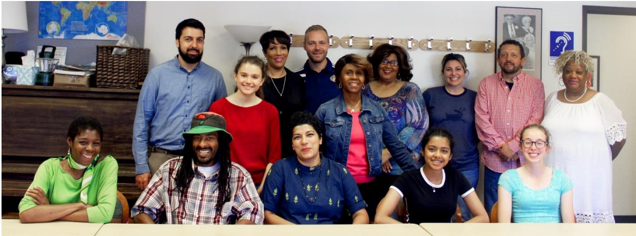
Health for All Steering Committee. Find photos for use in articles.

The new website is also home to information on the Health Department's recently formed Health for All Steering Committee. The steering committee was created this year to prioritize public health issues and take action to improve conditions that support health and well-being. The committee is made up of community members, local health system and hospital representatives, and other local organizational representatives.