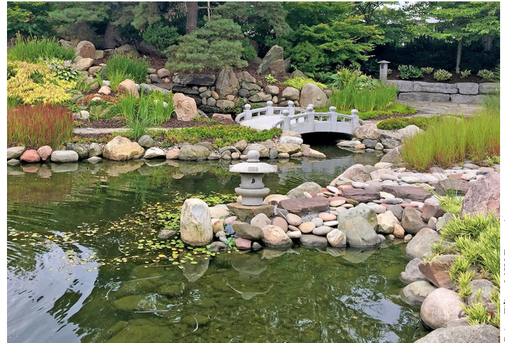
Paige Filice, MSU Extension

The State of Michigan’s Reduce Invasive Pet and Plant Escapes (RIPPLE) program encourages enjoyment of your water features and protection of the natural environment by offering responsible tips and solutions for disposing of dead, dying or unwanted aquatic plants and animals. Popular water garden plants and animals are known for their vigorous growth and rapid reproduction, and as a water gardener, you’ve likely experienced having too many to care for. If this occurs, remember it is never safe to release water garden plants and animals into the natural environment, even if they appear to be dead. It is extremely difficult to eradicate a species once it is established in the wild.